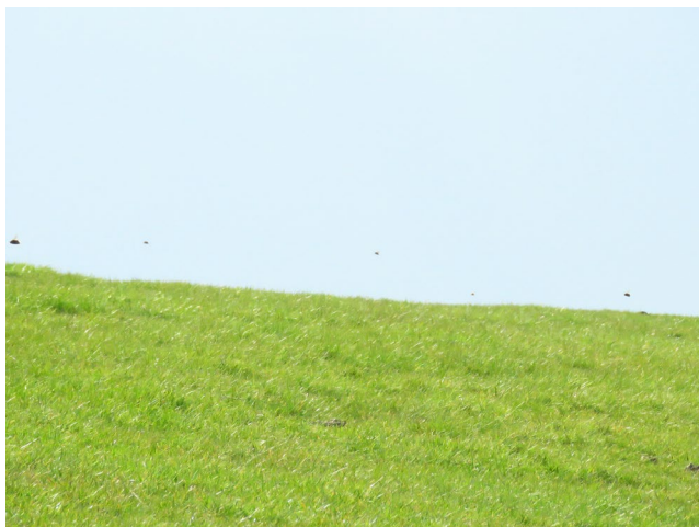
FIGURE 3 Bumblebees on migration at the Noordkaap, the Netherlands on 9 April 2016. A total of 3,387 queens were arrived from the Wadden Sea from the north, and then turned to follow the sea dike eastwards

the recent colonisation of Iceland by several continental bumblebee species (Potapov et al., 2018). While bumblebees migrating over sea may have stumbled upon Iceland before, the current, warmer climate may have allowed populations to establish only recently.